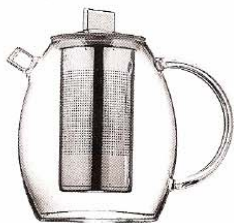
Teapot with Infuser / $35