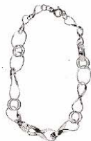
"Fettuccine" Necklace / $795