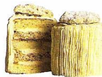
Pecan Dacquoise Cake / $7

A handy little tool for your bar or kitchen, this super-sharp 7¼-inch grater makes perfect zest. A scoring blade, cutters for ribbon peels, and a no-slip handle are built right in. Ultimate Citrus Tool by Microplane; williams-sonoma.com