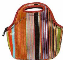
Food Tote / $23

The roomy, water-resistant neoprene tote goes anywhere you do, keeping its contents well insulated along the way. It's a better way to carry potluck dishes or everyday lunch. "Gourmet Getaway" tote in SoHo stripe; builtby.com